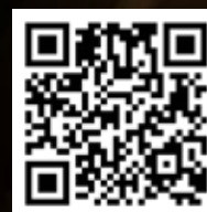
Scan to fill in the Entry Form